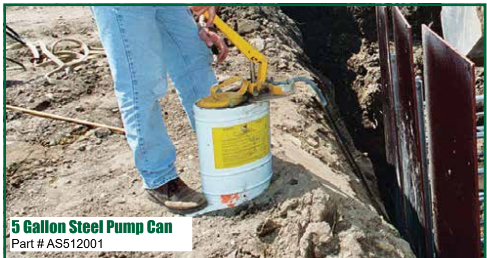
5 Gallon Steel Pump Can