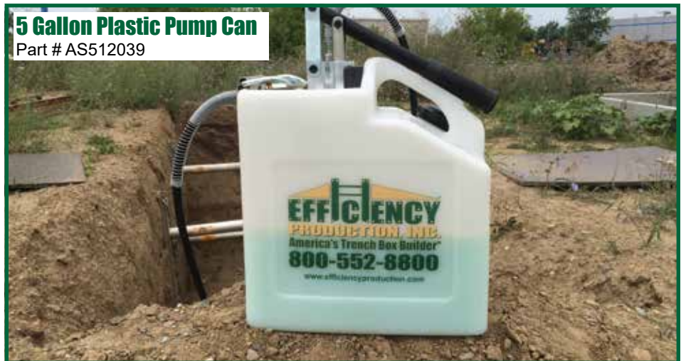
5 Gallon Plastic Pump Can

Mix one (1) part All-Season SF to four (4) parts clean water for protection over 30° F