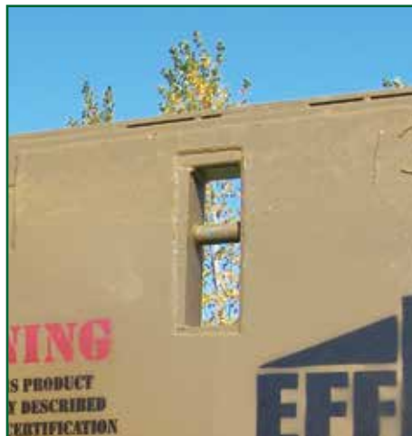
Thru-Wall Lifting Lugs

The four-point lift system is used for lifting shield sidewalls during assembly of the box, as well as the entire assembled shield. Lifting lugs are positioned for balanced lifting and easy handling.