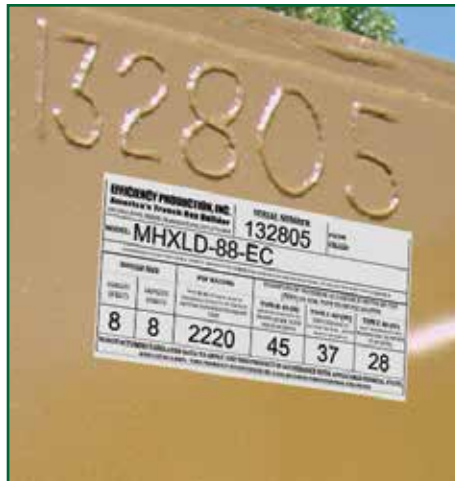
Depth Rating Certification Tag

All structural steel is fully tested and certified to be high strength, providing maximum depth to weight ratios.