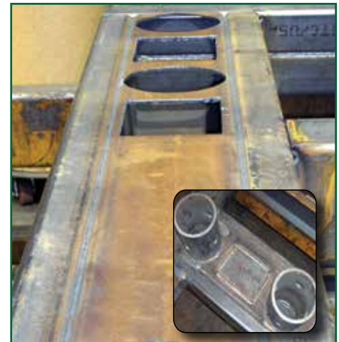
End Posts w/ Integrated Collars

Every trench shield includes a certification tag which is permanently affixed to the trench box sidewall. The certification tag includes the corresponding serial number for the trench shield and lists the shield's tabulated data including depth ratings.