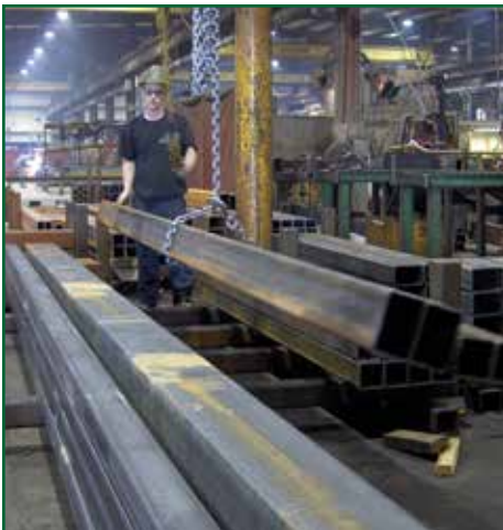
High Strength Mill Certified Steel

Innovative Features that Increase Job Productivity & Durability