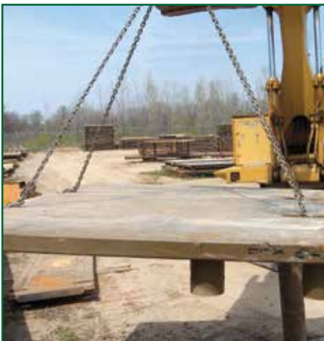
Four-Point Lift System

Collar pipes extend through the end tubes and are welded to the inside and outside walls and around the perimeter of the tube, offering maximum strength and rigidity.